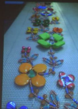
Electronic components (Capacitors, Resistors, Light Emitting Diodes, Beads)