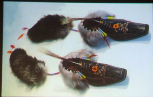
Fox Tail Moccasins (2016) 17.78 x 22.86 x 104.14 cm, mixed media.