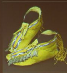
Southern Plains Moccasins