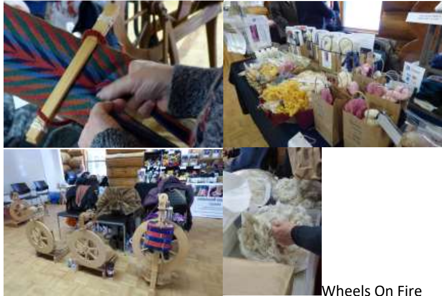
Wheels On Fire

For Sale: Knitting Machine Brother Model #KX350, never used, asking $200 or best offer. Contact Pat Trudel at pat.trudel@live.ca