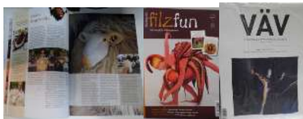
VAV 2019 #1

Filzfun 19/2 #62: For those of us whose written German is a bit weak there is a helpful English supplement!