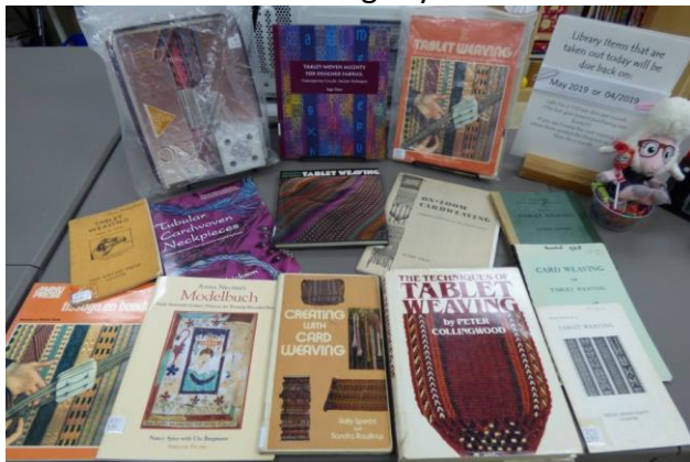
1 Tablet weaving books

Please remember to bring dry footwear for the meeting and in the studio.