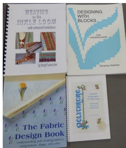
2 New books

Designing with blocks by Doramay Keasbey (733.5 Unit /Block weaves)