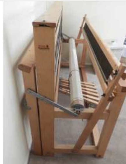
Leclerc 60" 4-harness Jack loom, folds to a depth of 25". $750

Also: Leclerc Dorothy 15". $100. Leclerc floor model warping mill. $200. Please contact Jayne Elliott at jelliott3349@rogers.com