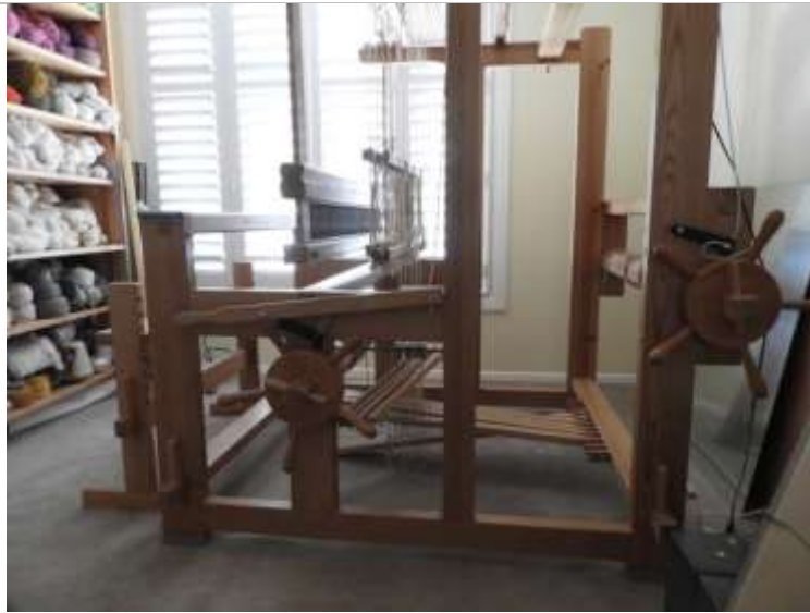
Swedish Glimakra Standard 10-harness countermark 47" (120 cm) loom. $2000