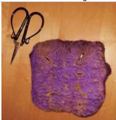
Carlene's practice cutting