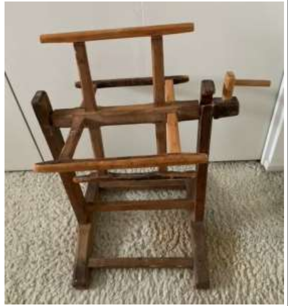
Antique Wooden Yarn Winder. Estimated 150 years old, wooden mortice & tenon joints, base height: 24". Price: $75