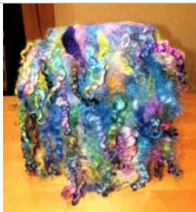
Carlene's final vessel