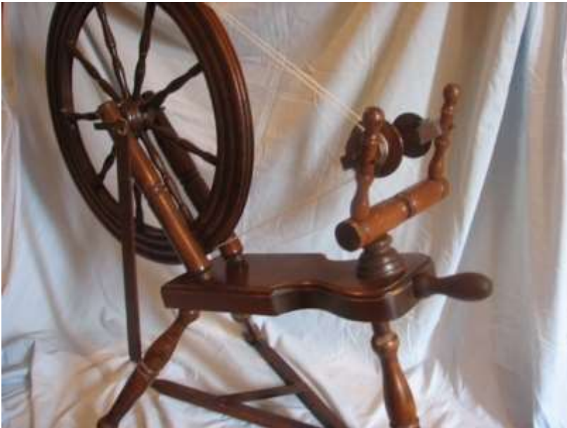
Roxton spinning wheel shaped object (SWSO), made in Quebec. Price: $50