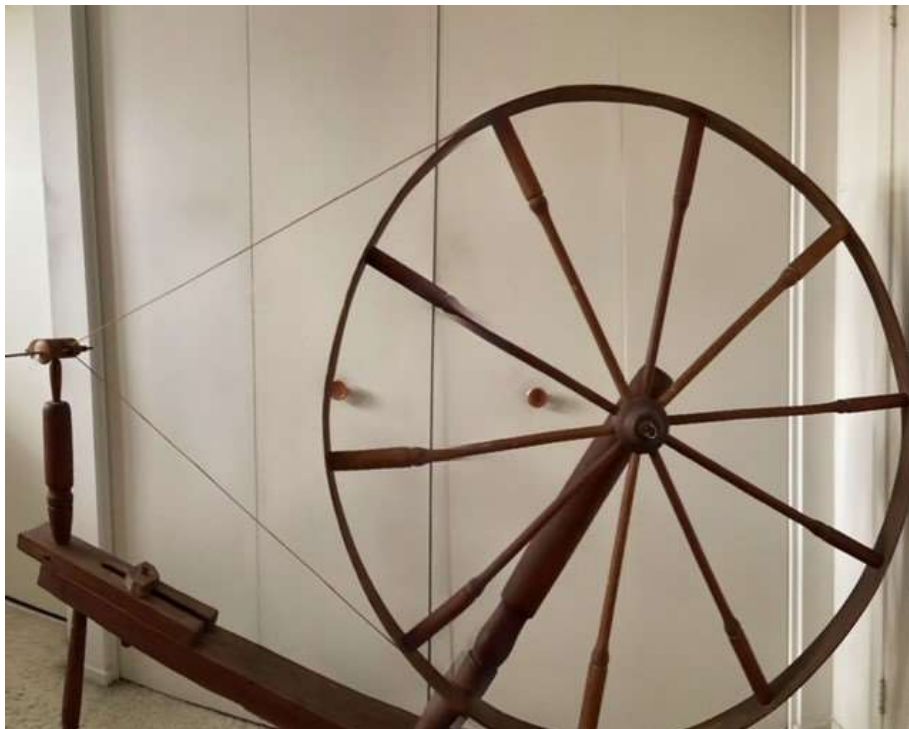
Antique Great Wheel, with direct drive spindle, approx. date: 1810, from Canadian Maritimes. In working order. Dimensions: Wheel: 46", Base: 45", wheel detaches for easy transport. Price: $300