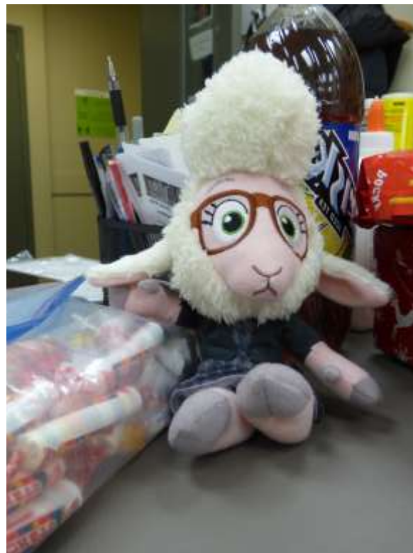
Library Day (our sheep mascot has candy, and she will share!!)