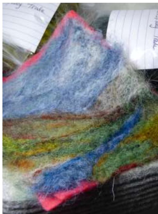
a quick landscape to test the wool felting mat.