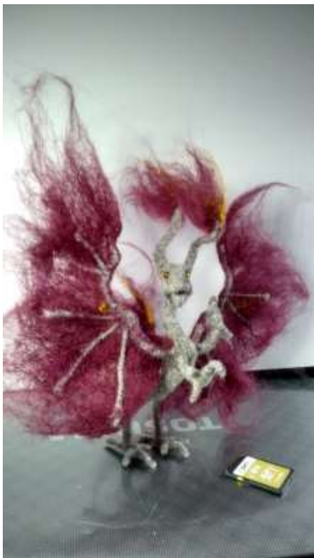
Mac the MacMaster University dragon for my Niece.