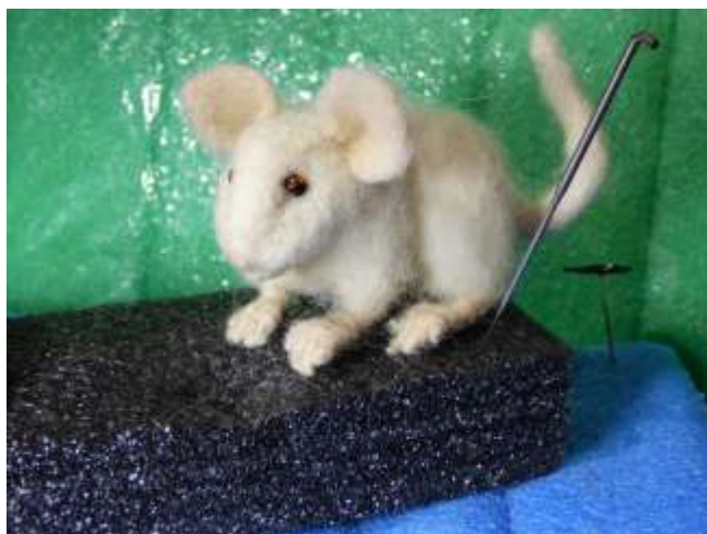
Mouse, made to test out foam felting surfaces.