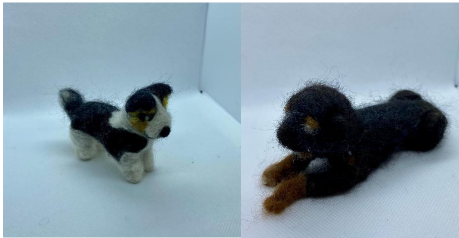
Diane Dillon (needle felting)

Entry rules and guidelines can be found on the first page of the entry form at the end of newsletter . For some idea of what we’re looking for in entries, check out these photos.